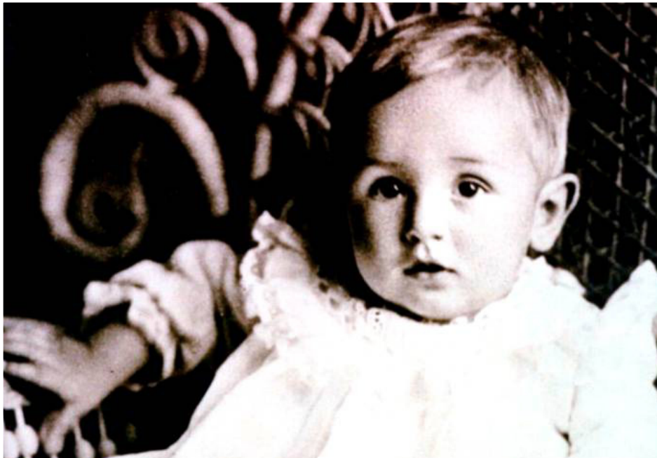
Walter Elias Disney